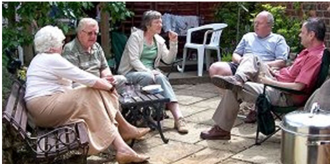
Garden Party conversation

Three or four events take place through each year, varying from Quiz Nights to Garden Parties to a trip to the House of Commons. The Christmas Dinner is a recent and firm favourite with members including a hugely enjoyable home grown entertainment. All these events help members of the choir to get to know each other better as well as help raise funds for the Choir.