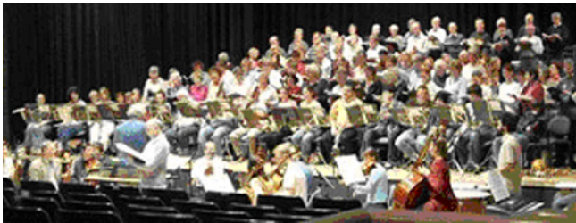
in rehearsal at The Castle for Elijah 2004

The three main concerts of the year are often accompanied by The Orpheus Players, an impromptu orchestra drawn together from local musicians. We also regularly welcome guest soloists, bands, children and young musicians to make music with us.